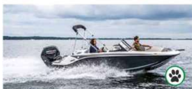
Bayliner M17 80cv - 5/6 personnes

Sunshade / Sunbathing / Bathing ladder / Tow bar / Bluetooth sound system / Water-skiing, wake boarding, towed buoys possible.