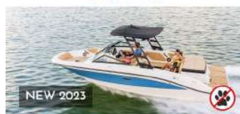
Searay SPX 210 - 250cv - 9/10 personnes

Very comfortable and spacious sports boat, performance and speed, ideal for enjoying towed sports with friends or simply for pleasure on a high-speed trip.