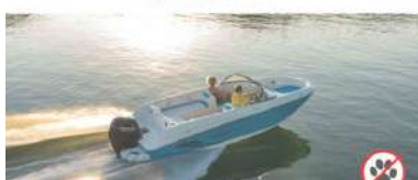
Bayliner Element E7 150cv - 10/11 personnes

Storage locker / Wake roll bar and sun awning / Swim ladder / XXL sundeck / Traction roll bar / Bluetooth sound system / Water-ski, wake board and towed buoy options.