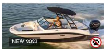
Searay SPX 190 - 150cv - 7/8 personnes

Spacious, comfortable boat with large XXL sundeck and comfortable sleeping cabin...performance, speed and fun with friends for sunbathing and towed sports.