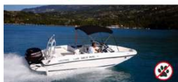
Bayliner Element E6 115cv - 8/9 personnes

Storage locker / Sunshade / Bathing ladder / XXL sundeck / Traction bar / Bluetooth sound system / Water-skiing, wakeboarding and towed buoy possible.